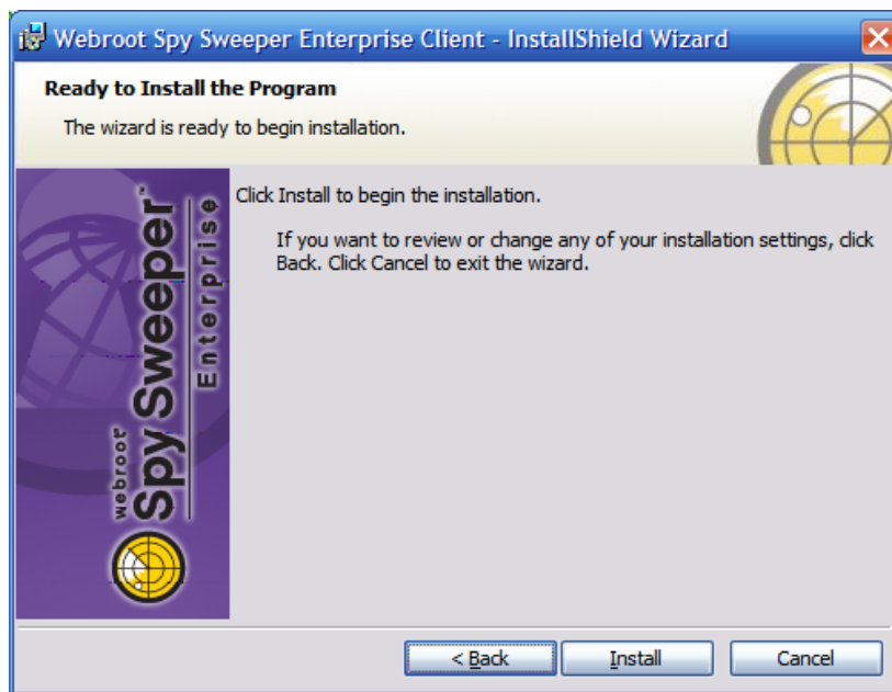
Ready to Install the Program window