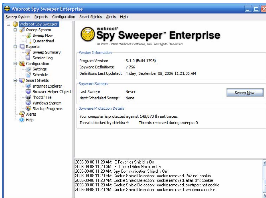
Webroot Spy Sweeper Enterprise window